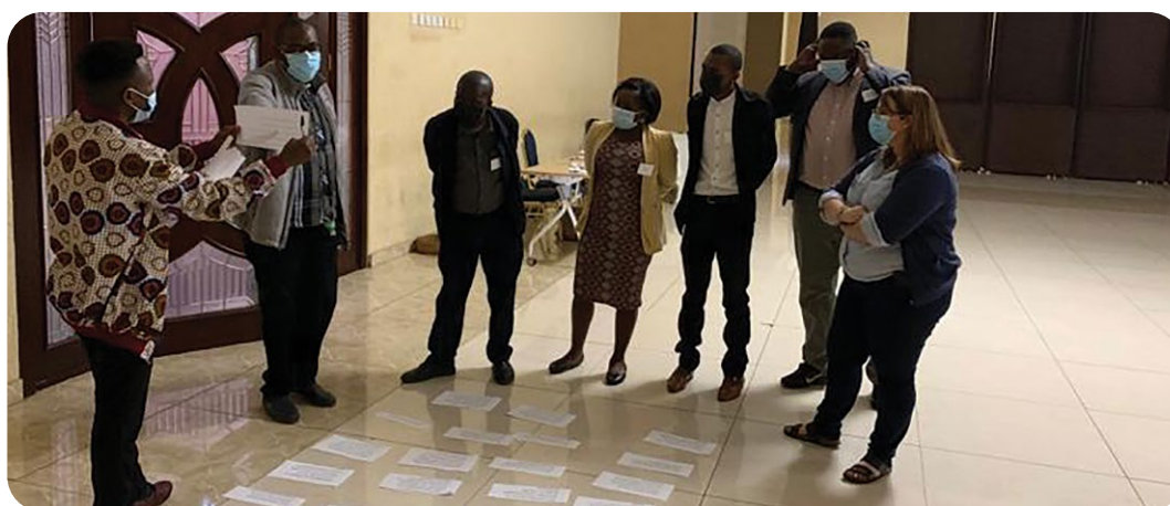
Small group of stakeholders discussing and prioritising AMR issues and messages, Malawi.