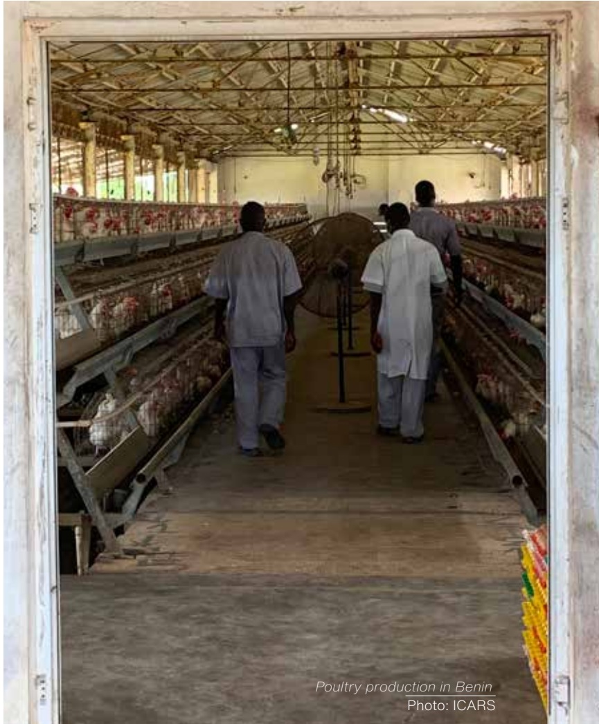
Poultry production in Benin

Biosecurity encompasses measures to prevent the introduction and spread of infectious agents, such as